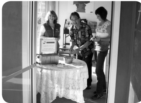
Ambassadors enjoying their time and company as they welcome Chamber members to the BAH at MCEDD.

For more information please call us at The Dalles Chamber: 541-296-2231.