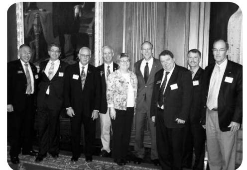
Members of The Dalles Community Outreach team met with Congressman Greg Walden during their recent trip to Washington D.C.