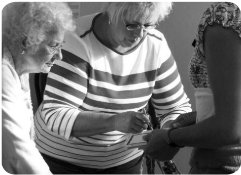
Chamber members & guests participated in the 50/50 drawing upon arriving to the most recent Business After Hours at MCEDD & Red Wagon Antiques.

Business After Hours in October will be held on Thursday, October 21 at Bob Stone Freeway Auto, 2222 W. 6th Street, The Dalles, OR 97058.